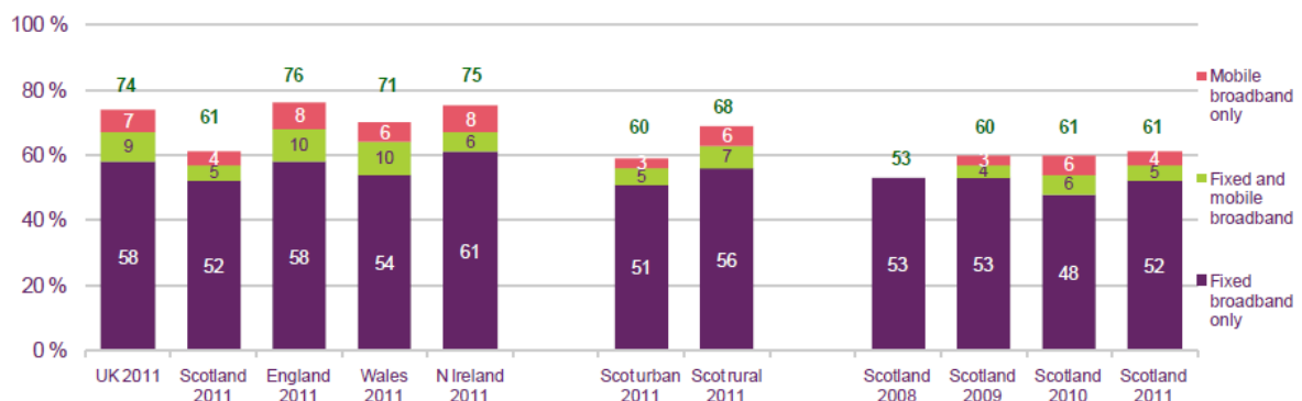
Figure 4.1 Broadband take-up at home

This situation is amplified in particular areas where broadband take-up is lower than in the general population eg. Glasgow, where take-up lies at 50%.